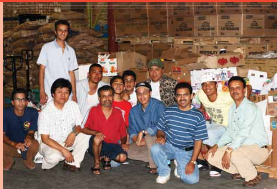
The Nepalese Association of Ottawa raised more than $12,000 worth of food and funds at their annual Multicultural Dance & Music Show and door-to-door food drive. Volunteers delivered the donations to The Food Bank after a wonderful day of diverse entertainment and family-oriented activities. Thank you to all the volunteers and donors who made this event a continued success!

Want more details? Check out our events calendar at www.theottawafoodbank.ca